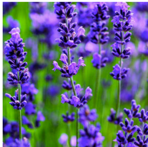
Munstead English Lavender