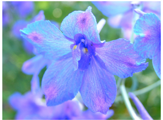
Blue Pygmy Delphinium