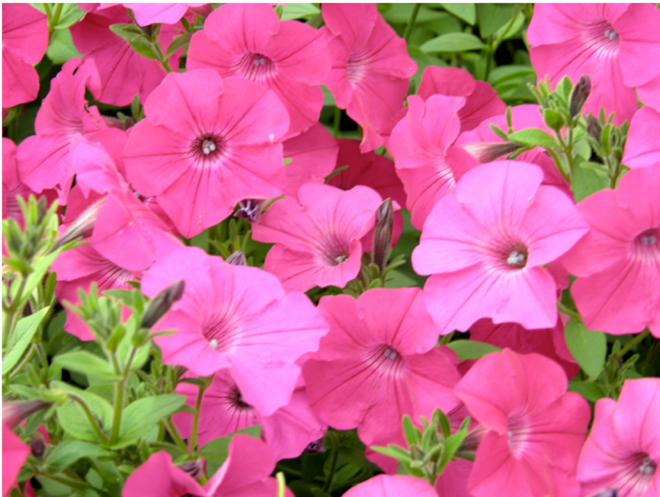
Tidal Wave Hot Pink Petunia