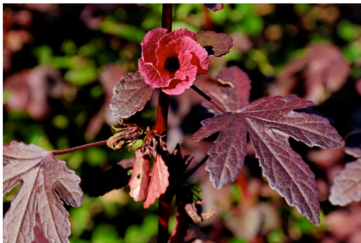
Red Shield Hibiscus