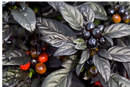
Serena Angleonia--lavender, purple & white