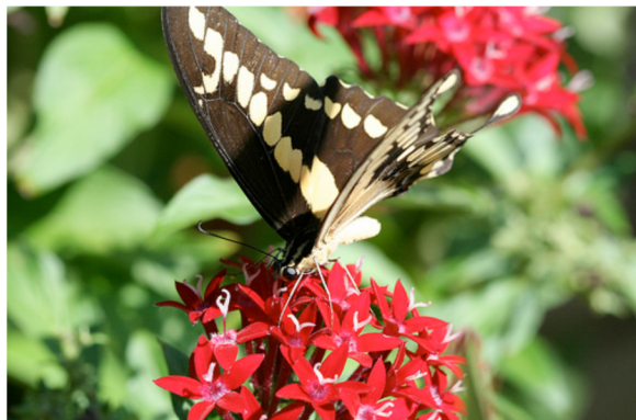
Penta Graffiti Red Lace