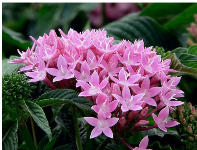
Butterfly Pink Penta