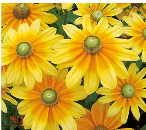
Prairie Sun Rudbeckia