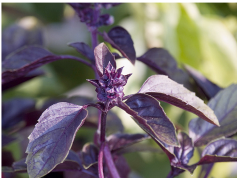
Dark Opal Purple Basil