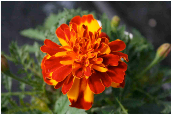
Bonanza Bolero Marigold