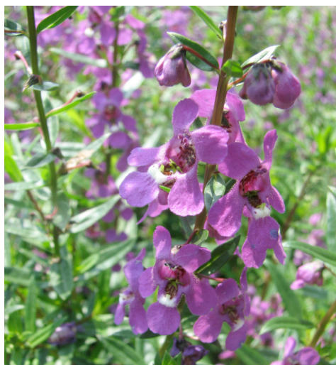
Serena Purple Angelonia