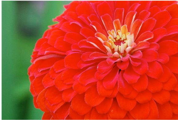
Benary's Giant Scarlet Zinnia