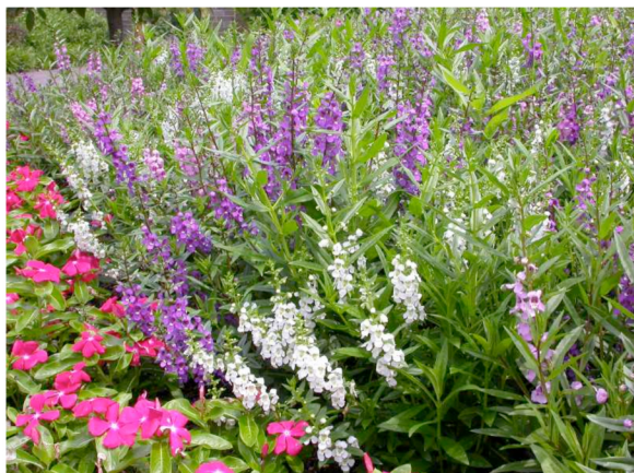
Serena Angleonia--lavender, purple & white