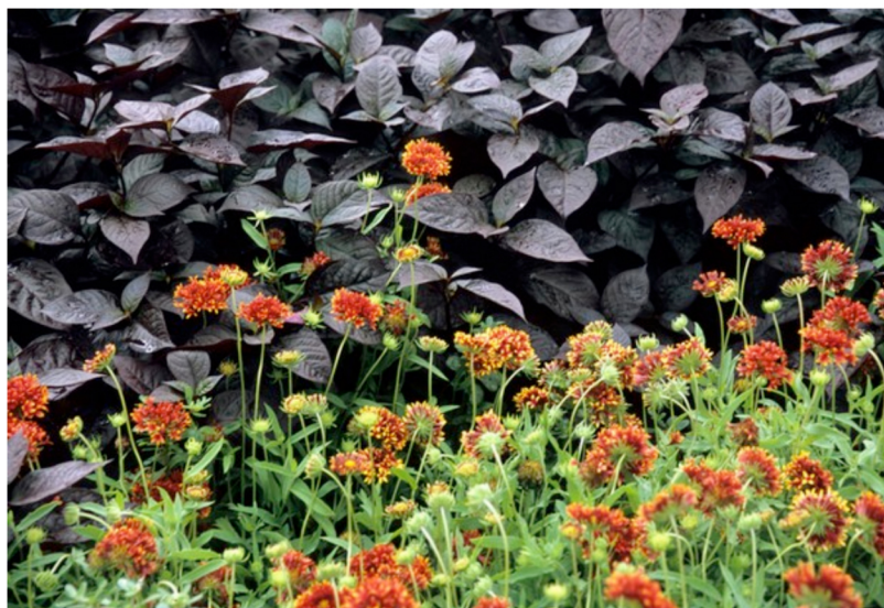
Purple Knight Alternanthera---striking dark foliage