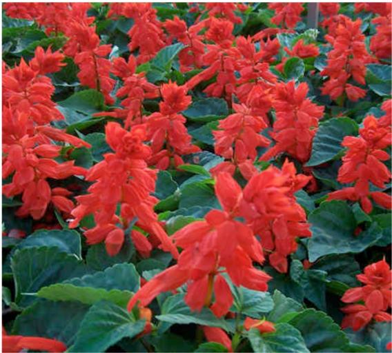
Red Hot Sally Salvia