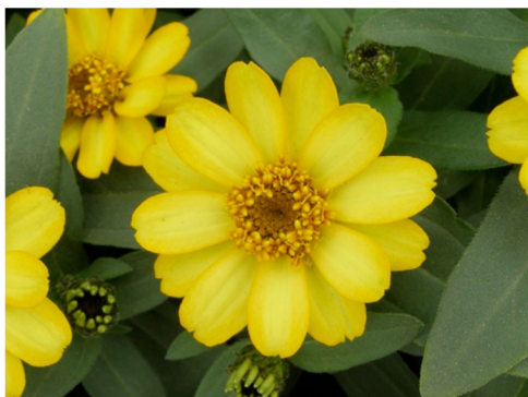
Profusion Yellow Zinnia