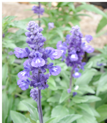
Blue Victoria Salvia