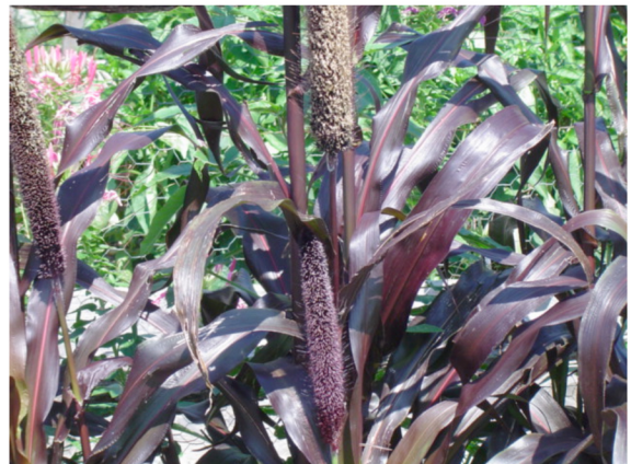
Purple Majesty Ornamental Millet